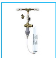
Installation Rail with FILTER XL In-Line Filter.