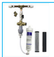
Installation rail with green Filter Housing and green Carbon Block Filter Candle or green nanofilter Candle.