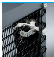
FloodGuard - Inlet solenoid only opens to allow water into the cooler, when water is dispensed. By remaining closed all other times it protects the cooler against leaks.